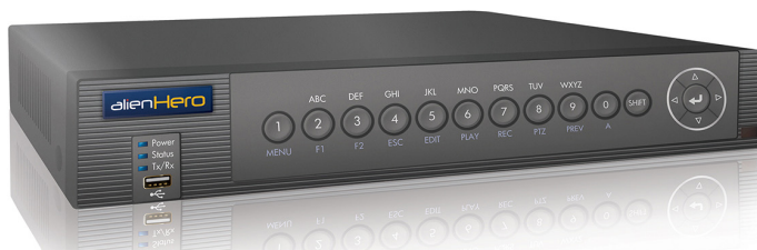
Product Code: ALIEN654

In this solution, the DVR is hidden in a cupboard or loft space. The transmitter is used to send the video output from the DVR to a suitable location for the user. The user can then use the DVR's remote control to change camera channels, replay footage etc using the VideoMitter's ability to send the IR remote control signals back to the DVR. This is a very popular solution which enables far greater flexibility in siting the DVR.