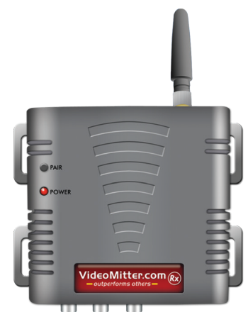
VideoMitter Product Code: MITKIT